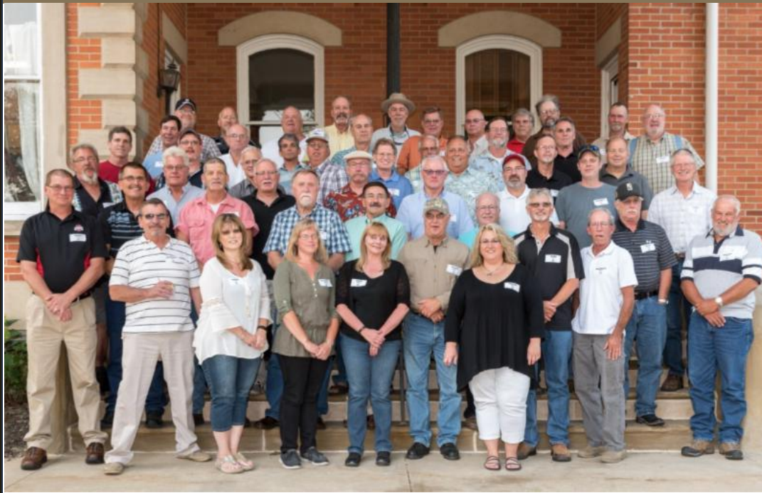
R.W. Sidley, Inc. employees with 25+ years of service.