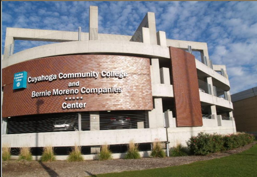
Cuyahoga Community College Parking Garage, Cleveland, OH