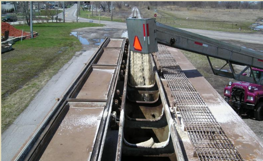
Pro/Angle bunker sand loaded on to a closed hopper rail car.

Rob Sidley, VP Aggregate Sales 7123 Madison Road Thompson, OH 44086 440.298.3232 Ext. 3135 440.343.2371 Cell robsidley@rwsidley.com www.rwsidley.com