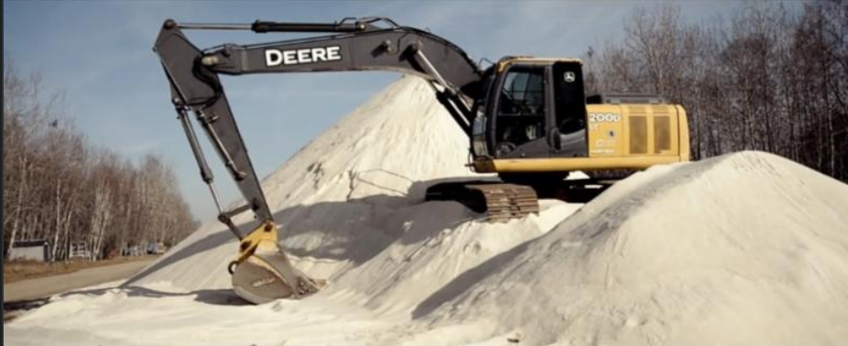
Stock pile of Pro/Angle bunker sand at Bigwin Island Golf Club, Lake of Bays, ON.