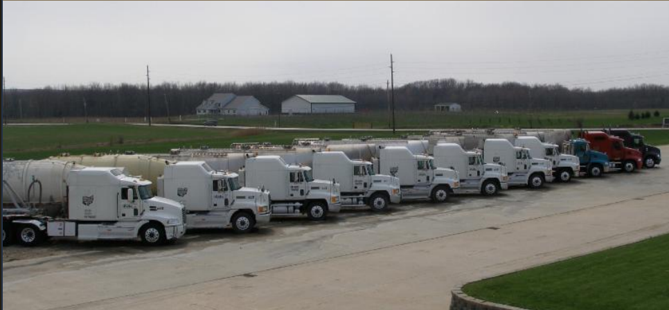
Truck fleet at J.P. Jenks, Inc., Madison, OH.