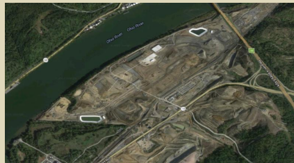
The site of the new Shell Cracker Plant along the Ohio River in Beaver County, PA.

The new 500-car parking garage is the only major structure completed at this time. There has been a lot of site, rail and road work completed to give access to the site.